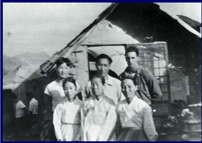
Sun Myung Moon and some of his early followers outside the cardboard shack that was his first church, in Busan, Korea. He had returned to the South as a refugee in 1951 after being imprisoned for almost three years in a North Korean communist prison camp.

It all began on Easter Sunday, 1935, when he had a life-changing spiritual encounter with Jesus, who revealed to him a God of grief who had been suffering ever since losing his children to the fall.