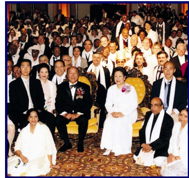
Sixty clergy couples from different faiths after celebrating their international marriage blessing in New York, 2001

The heart and soul of Rev. and Mrs. Moon’s lifelong ministry as True Parents is the re-establishment of God’s ideal of the family as the cornerstone of world peace. The Marriage Blessings began with just three Korean couples in 1960 and have now reached millions of families from every faith and background. All are welcomed and encouraged to participate.