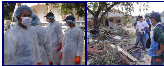
UPF has been active in disaster recovery in Asia and the US after hurricanes and earthquakes. It is fighting HIV/AIDS, helping youth to prepare for marriage, work for change and serve their communities.

“Religion is not simply about dogma and belief. Faith is made real through substantial acts of love and service.”