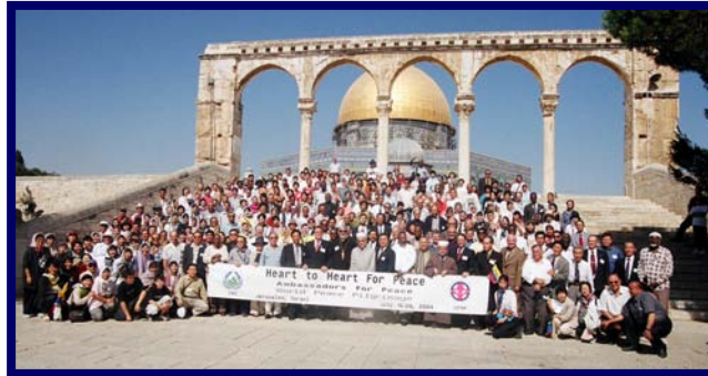
Among the more notable efforts of the UPF is the Middle East Peace Initiative. Thousands of religious and lay leaders travel to Israel and Palestine, working with the children of Abraham to unite in peace.

Today Rev. and Mrs. Moon are proposing a revitalized, renewed United Nations with the help of the Universal Peace Federation (UPF), together with more than 100,000 diplomats, clergy, civic leaders, and current and former heads of state who have been appointed as Ambassadors for Peace.