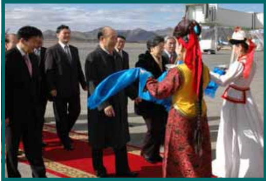
The UPF Peace Tour arrives in Mongolia

Another important theme was the challenge of breaking down the barriers that divide people, as well as nations. After all, before any country can think about ending conflict and making peace, the citizens of that nation must first overcome divisions based on religion, ethnicity, culture and language.