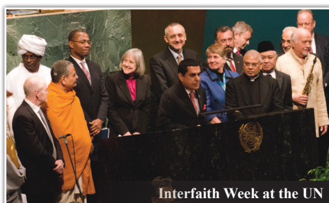
Interfaith Week at the UN

Together with the African Union, UPF organizes Africa Day celebrations in New York and around the world. In support of World Interfaith Harmony Week , UPF works with interfaith and faith-based NGO's to hold celebrations in 27 nations as well as at the UN General Assembly. UPF recommends the creation of an interreligious council at the United Nations.