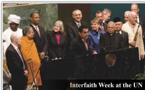
Interfaith Week at the UN

Together with the African Union, UPF organizes Africa Day celebrations in New York and around the world. In support of World Interfaith Harmony Week , UPF works with interfaith and faith-based NGO's to hold celebrations in 27 nations as well as at the UN General Assembly. UPF recommends the creation of an interreligious council at the United Nations.